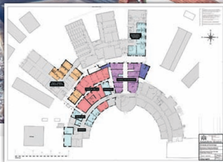
The architects proposed ground floor plan