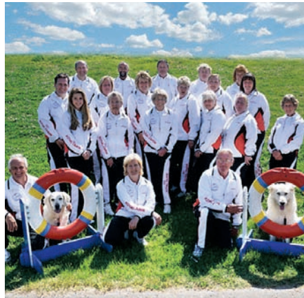
The Solent District Dog Display Team