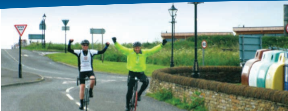
960 miles and 69 hours and 23 minutes later... the end!

We have eight places available for the 2014 London Marathon. If you would like to sponsor our runners or to enquire about a place please contact the Trust Office on 01223 337630.