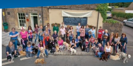
Participants in Mandy's Fun Dog Day